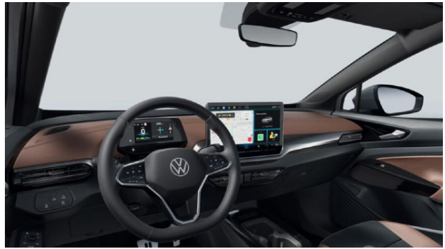
Standard selection from ID.5 PRO PLUS