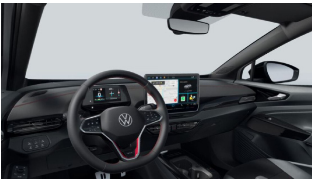
Standard on ID.5 GTX / GTX PLUS