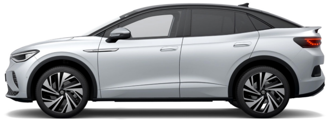
Scale Silver Metallic 1,3 1TA1