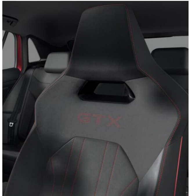
GTX Art Velours/Leatherette Soul/Flash Red Standard on ID.5 GTX PLUS Optional on ID.5 GTX

Note: Some parts of leather interior trim will contain artificial leather. Note: The print processes do not allow exact reproduction of the upholstery & insert colours.