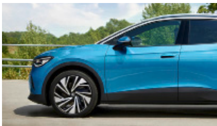
Costa Azul Metallic 1,2 3KA1