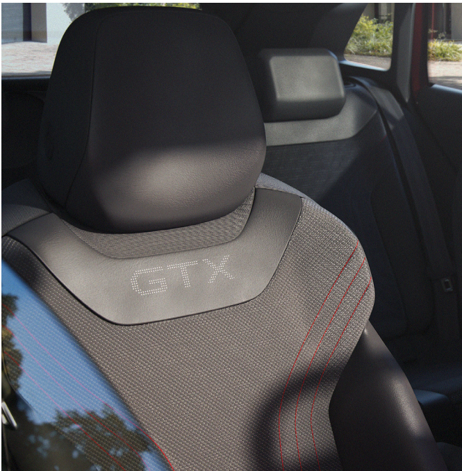
GTX Cloth/Leatherette Soul/Flash Red Standard on ID.5 GTX