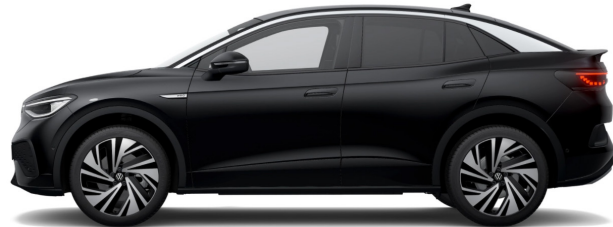
Mythos Black Metallic 1 OE0E