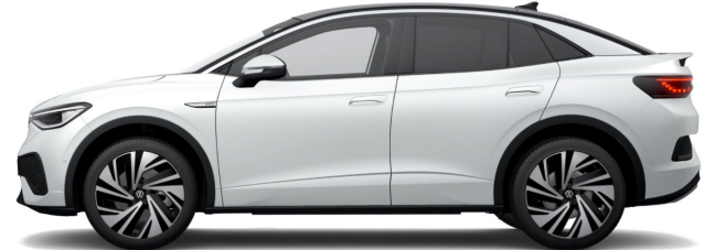
Glacier White Metallic 1 2YA1