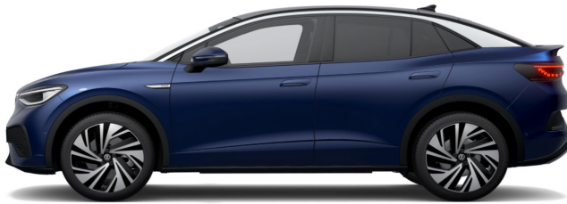
Blue Dusk Metallic 1,2 2PA1