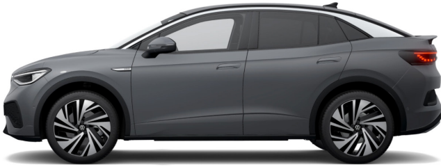
Moonstone Grey Solid C2A1