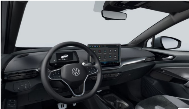
Standard from ID.5 PRO