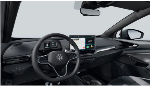
Standard from ID.5 PRO PLUS