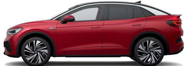
King's Red Metallic 1 P8A1