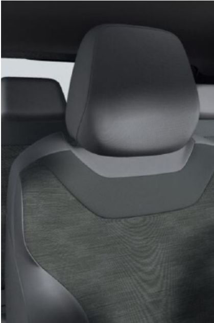
Fabric 'Matrix' Soul/Platinum Grey Standard from ID.5 PURE / PRO